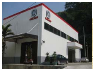
Exterior of the lab

Since the foundation of Hsinchu lab in 1998, Bureau Veritas ADT has served the local clients for more than 10 years. On account of growing demands from Hsinchu local electronics industry that has expended progressively over the past years, we planned to establish another testing base last year. Then, the building was completed this January as well as the installation of equipments. After accredited by authorities, we are pleased to announce that the new lab is put into service. Per a free trial taking place last month, we got favorable comments from clients on the new facilities. On March 17, we had an official opening ceremony to announce the operation of the lab.